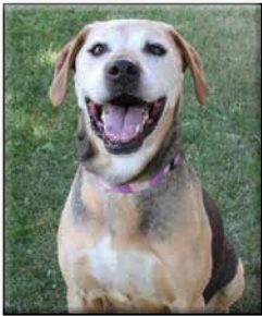
ABBY Spayed Female Beagle/Fox Hound Cross Approximate DOB: October 2009

See more CDHS adoptable pets at www.cdhs.net