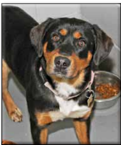
BRADLEY Neutered Male Rottweiler Mix Approximate DOB: June 2020