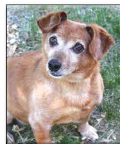
PIPSIE Spayed Female Chihuahua/ Dachshund Cross Approximate DOB: October 2010