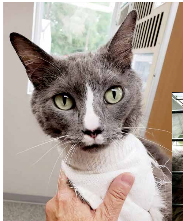
Boop the Cat visited the right yard and the right person, who knew he needed help. He is now safe at CDHS and on the mend.