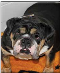
BERTHA Spayed Female Old English Bull Dog Approximate DOB: June 2015