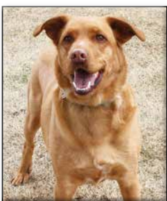
COLIN Neutered Male Lab Cross Approximate DOB: February 2017