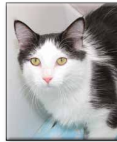
MILANO Spayed Female Long Hair (DLH) Black and White Approximate DOB: August 2020