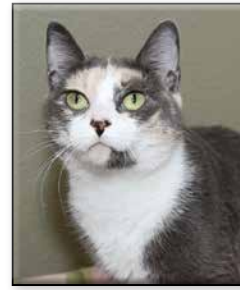
MARGUERITE Spayed Female Short Hair (DSH) Dilute Calico Approximate DOB: November 2018