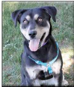
GLORY Spayed Female German Shepherd Cross Approximate DOB: October 2020