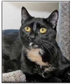
DEE Spayed Female Short Hair (DSH) Tortie Approximate DOB: August 2020