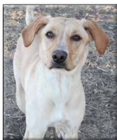
KONA Spayed Female Lab Cross Approximate DOB: January 2020