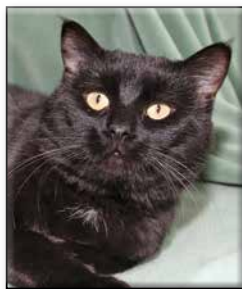
KIEL Neutered Male Short Hair (DSH) Black DOB: August 2017