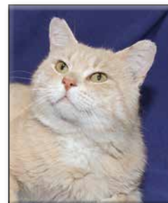
NORM Neutered Male Short Hair (DSH) Buff/Orange Tabby Approximate DOB: June 2017