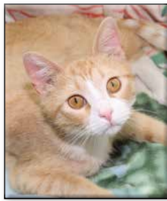
GREASY Neutered Male Short Hair (DSH) Orange Tabby and White Approximate DOB: September 2020