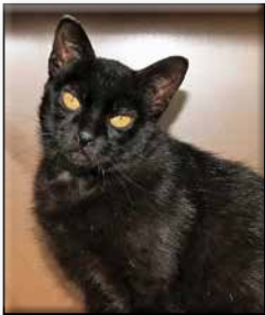
BAKLAVA Neutered Male Short Hair (DSH) Black Approximate DOB: February 2019