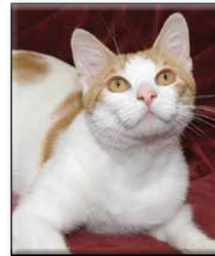
MCNEIL Neutered Male Short Hair (DSH) Orange and White Approximate DOB: April 2020