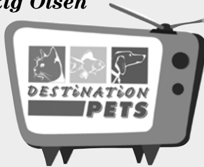
Produced by Central Dakota Humane Society and Dakota Media Access

Also available online at dakotamediaaccess.org and cdhs.net .