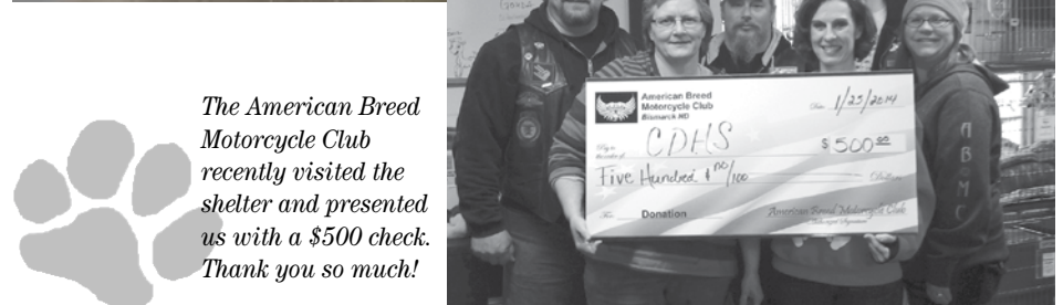
The American Breed Motorcycle Club recently visited the shelter and presented us with a $500 check. Thank you so much!