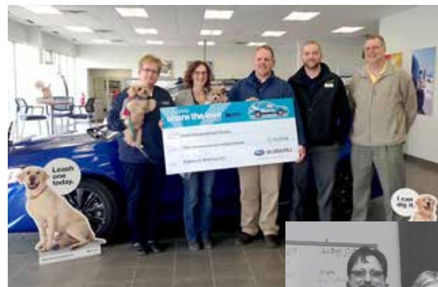
Kupper Subaru recently presented CDHS with a check for $3,716.46. The proceeds came from their promotion that offered new car buyers to select a charity of their choice. What a great way to support the community!