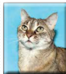
Kosha Spayed Female Short Hair (DSH) Brown Tabby Approximate date of birth: August 2008 Origin: Stray