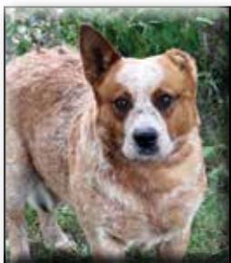
Kathryn Unspayed Female Red Heeler Approximate date of birth: June 2012 Origin: Rescue