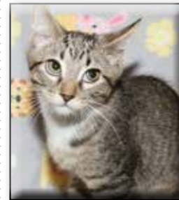
Bordeaux Unneutered Male Short Hair (DSH) Brown Tabby Adopted Approximate date of birth: May 24, 2016 Origin: Stray