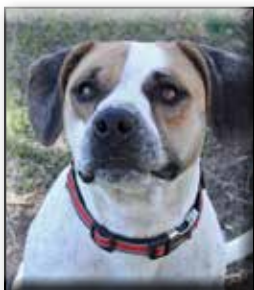
Lucy Spayed Female Pitbull/Heeler Cross Approximate date of birth: April 2014 Origin: Stray

See more CDHS adoptable pets on the web at www.cdhs.net/adoptablepets.htm