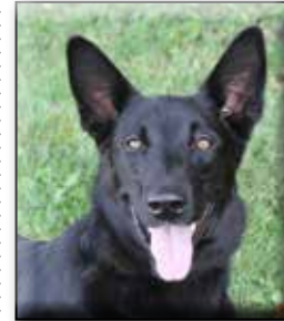
Kali Unspayed Female Shepherd/Lab Cross Approximate date of birth: March 2016 Origin: Stray