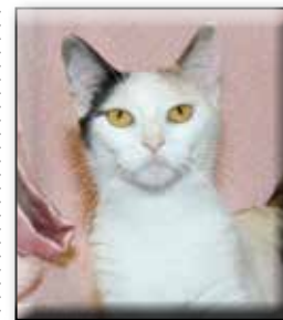
Habasi Unspayed Female Short Hair (DSH) Calico Approximate date of birth: July 2013 Origin: Owner Surrender