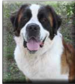
Atlas Neutered Male St. Bernard Approximate date of birth: July 2014 Origin: Abandoned