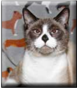
Archibald Unneutered Male Siamese Adopted Approximate date of birth: July 2014 Origin: Stray

See more CDHS adoptable pets on the web at www.cdhs.net/adoptablepets.htm