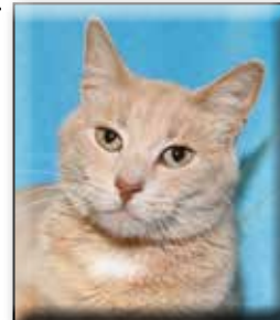
Mandalay Spayed Female Short Hair (DSH) Orange Approximate date of birth: August 2013 Origin: Stray