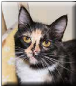
Blanche Unspayed Female Long Hair (RLH) Calico Adopted Approximate date of birth: June 2014 Origin: Stray