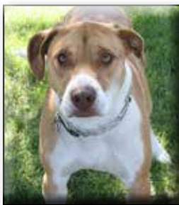
Devo Neutered Male Mixed Breed Approximate date of birth: January 2014 Origin: Stray