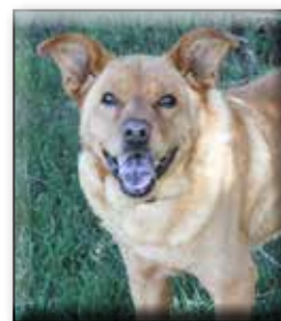
Ricco Unneutered Male Chow Cross Approximate date of birth: June 2004 Origin: Unclaimed Impound