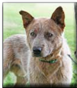
Rusty Unneutered Male Red Heeler Approximate date of birth: June 2014 Origin: Rescue