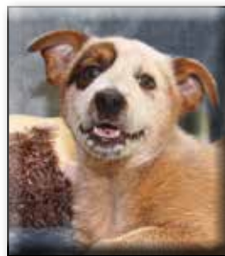
Cherry Unspayed Female Red Heeler Adopted Approximate date of birth: July 13, 2016 Origin: Born at Shelter