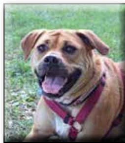
Mags Spayed Female Pitbull Mix Adopted Approximate date of birth: December 2014 Origin: Owner Surrender