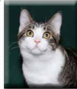
Bernie Neutered Male Medium Hair (DMH) Tabby and White Approximate date of birth: March 16, 2016 Origin: Stray