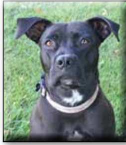
Juno Unspayed Female Pitbull Approximate date of birth: September 2015 Origin: Stray