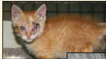
Terra Cotta as a baby; grown-up Terra Cotta; calendar queen Terra Cotta.