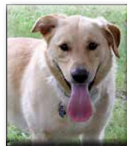
Rex Unneutered Male Yellow Lab Cross Approximate date of birth: October 2012 Origin: Stray