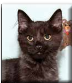
Manchu Unneutered Male Long Hair (DLH) Black Approximate date of birth: May 2014 Origin: Stray