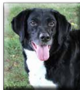
Jack Neutered male Springer cross Approximate date of birth: June 2005 Origin: Owner surrender