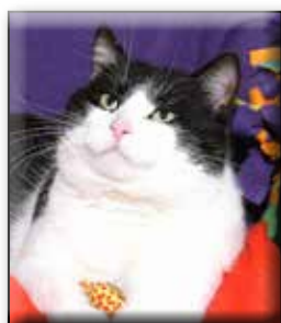
Barley Neutered Male Short hair; black and white Approximate date of birth: December 2011 Origin: Stray