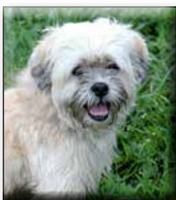
Gizmo Unneutered Male Lhasa Apso Approximate date of birth: April 2010 Origin: Owner Surrender