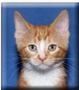
Falafel Unspayed Female Short Hair (DSH) Orange and White Approximate date of birth: July 2014 Origin: Stray