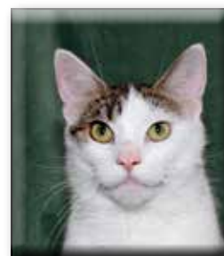
Crew Neutered Male Short Hair (DSH) Tabby and White Approximate date of birth: July 2012 Origin: Stray