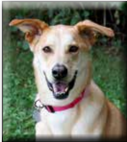
Sadie Spayed Female Mixed Breed Approximate date of birth: October 2009 Origin: Owner Surrender