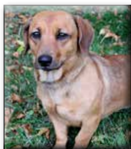
Salina Unspayed female Dachshund cross Approximate date of birth: Sept. 2013 Origin: Stray