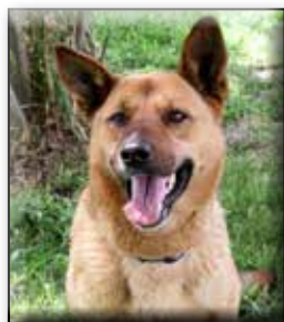
Charlie Unneutered Male Shepherd/Heeler Cross Approximate date of birth: December 2013 Origin: Owner Surrender

See more CDHS adoptable pets on the web at www.cdhs.net/adoptablepets.htm